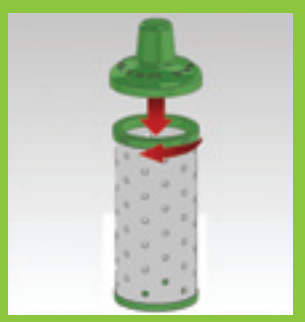
Screw the cap onto the inner chamber with a 1/2twist