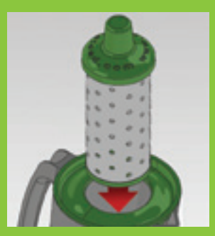
Insert the inner chamber into the jug.